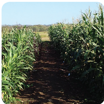
Figure 7a. A standard variety of field corn grown on a low-fertility tropical soil shows nutrient deficiency stress (left) while Mandaamin Institute's N-efficient field corn maintains vigor.