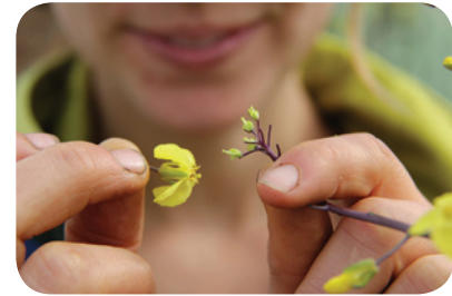
Organic Seed Alliance

Another challenge is how to ensure adequate compensation for farmer-breeders to make on-farm cultivar development economically viable, yet keep new cultivars accessible without undue intellectual property rights (IPR) restrictions (Zystro, 2016). Already, the growing number of utility patents on crop cultivars or traits seriously limits farmer and public breeder access to crop germplasm. The Open Source Seed