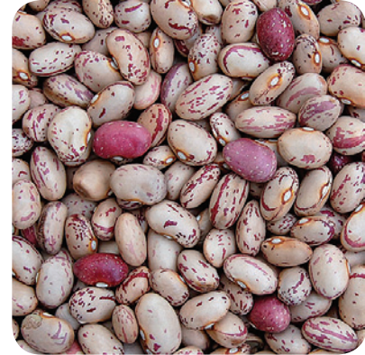
Seed Savers Exchange

The University of Minnesota research team has also developed several new soybean lines with early vigor and rapid canopy closure (weed competitiveness) that will undergo yield trials in 2017. One of these is a large-seeded, yellow-hilum, high-protein line that has been proposed for seed increase and release through the Minnesota Agricultural Experiment Station as a food grade soybean for organic producers (Orf, 2016). The team is also comparing the N fixing efficacy of field-collect-