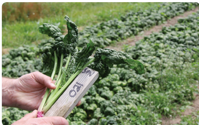
Figure 3. Organic spinach grown in an Organic Seed Alliance breeding project

this vital endeavor by growing organic crop seed (a potentially profitable enterprise), conducting on-farm trials of cultivars and breeding lines, and breeding and selecting new cultivars. Many producers have successfully acquired the necessary skills to grow organic seed and improve crop genetics for organic systems to their own benefit and that of the entire organic sector. Examples of new cultivars developed primarily by farmers include Peacework bell pepper, Who Gets Kissed sweet corn (Figure 4), Solstice broccoli, the Seminole X Waltham advanced breeding line of butternut squash, and FBC Dylan wheat.