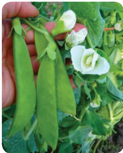
Figure 5. Snow pea variety Ho Lan Dow identified in NOVIC project field trials as tops in flavor with excellent yield and disease resistance

collected and trialed carrot cultivars and breeding lines from around the world, and documented substantial genetic variation in germination rate, seedling vigor and canopy size (traits related to weed competitiveness), as well as disease and nematode resistance, flavor, and a diversity of colors (Simon et al., 2016a, 2016b, 2016c; Turner, 2015). Some Eurasian lines combine large canopy and resistance to Alternaria leaf blight (Simon et al., 2016a), which may help address this constraint on production of large-top varieties in humid climates. In multisite trials in the West (California and Washington) and Midwest (Indiana and Wisconsin), “[l]ines that emerged and formed a full canopy earlier than others resulted in the greatest crop yield in the presence of weeds as well as the greatest ability to suppress weed. [Thus,] selection of lines that favor early and full top canopy growth can be used as a low input, integrated weed management tool.” (Simon, 2016c). Having documented significant differences among locations and production systems (organic versus conventional) in active soil organic matter and microbiota, the research team is now analyzing variation among cultivars in endophytic and rhizosphere microbiota.