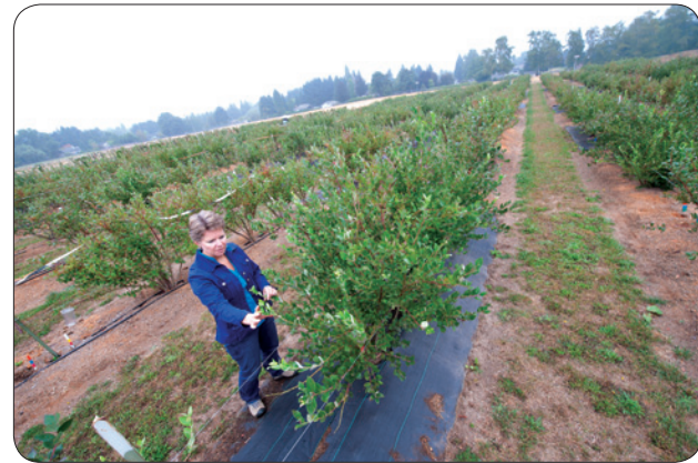
Oregon State University