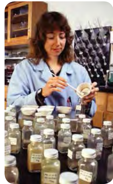
Soil analyses for various soil carbon fractions help tell how much carbon plants have pulled from atmospheric Co2 and stored in soil organic matter.