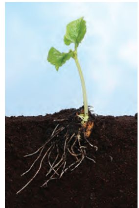
Figure 2. Seedling.

Bioremediation is an intentional process used to eliminate environmental pollutants from contaminated sites (Madsen, 2003). Other contaminants that can be removed via bioremediation include those from industrial processes and hazardous waste. The process includes using microorganisms, fungi and plants to decompose, sequester or remove soil contaminants, such as agricultural pesticides and fertilizers (Figure 2).