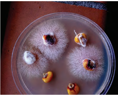
Figure 3. Fusarium infection on corn seeds.

These projects highlight the potential for new research to explore the beneficial role microbes can play in organic plant production.