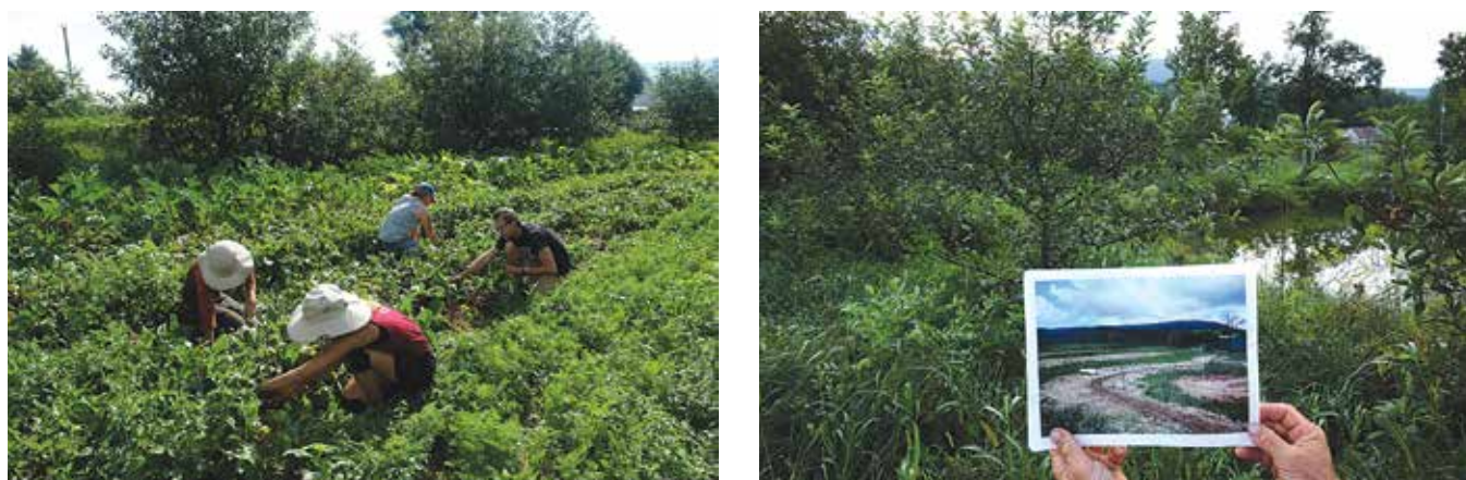
Figure 6. Farm employees and CSA sharers pick crops from level, fertile growing beds in 2019, with apple trees, native berries, and comfrey on the terrace berm in the background (left). Irrigation pond at time of installation of the perennial planting (right, inset) and about six years later (right). The perennial plant community supports a diversity of wildlife and keeps the pond free from excess sediment and nutrients.

The terrace system keeps the soil in place while cover crops, diverse rotation, organic amendments, and reduced tillage build SOM and biological activity in the vegetable beds.