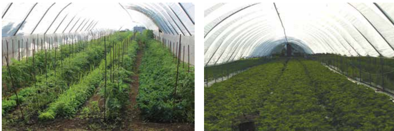
Figure 7. Leafy greens nearing harvest and tomatoes in vegetative growth (left), and strawberries on landscape fabric (right) in the Haygrove high tunnel system at Elmwood Stock Farm.

F or protected crop production, Elmwood Stock Farm uses a Haygrove high tunnel system, which covers a wider area of field under a series of three hoop structures joined together along what would be the sidewalls of a single hoophouse (Figure 7). Each unit is 270 ft long and 26 ft wide (total width 78 ft, area covered 21,060 sq ft or 0.48 ac). Because this system is not designed to bear snow loads, which can be substantial in Kentucky, the farmers remove the plastic roof in the fall and replace it in March. While this entails additional labor, it allows winter precipitation to reach the Haygrove production area and leach out salts.