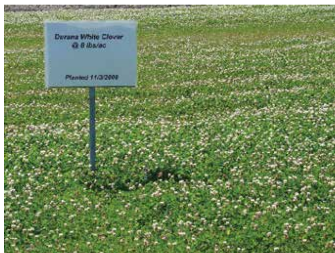
Steve Diver (2)

Figure 8. Extensive organic rice field trials at the USDA Rice Research Station in Beaumont, Texas (left) showed best results with legume cover, organic fertilizer, and microbial inoculants used together. Durana white clover (right) has become a leading cover crop in organic rice rotations, preferred for its perennial nature and substantial N contributions.