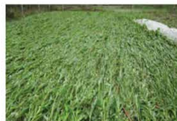
Figure 3. In Floyd, VA, timely planting of a late summer cover crop of sorghum-sudangrass (left) after a July potato harvest prevented catastrophic soil loss when a freak rainstorm on September 29, 2015 sent three feet of flood waters into the field (center). The raging river toppled the fence and flattened the cover crop but took no soil at all (right).