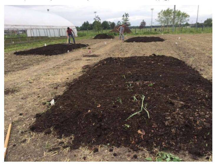
Figure 4. Tomato trial research plots