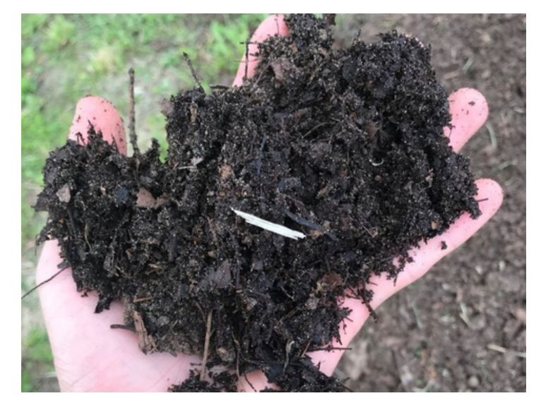
Figure 2. Three-year old leaf mold compost