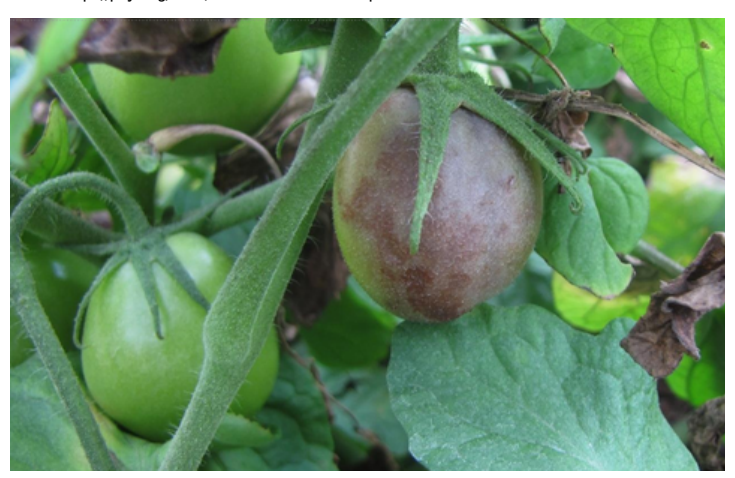
Figure 3. Late blight of tomato